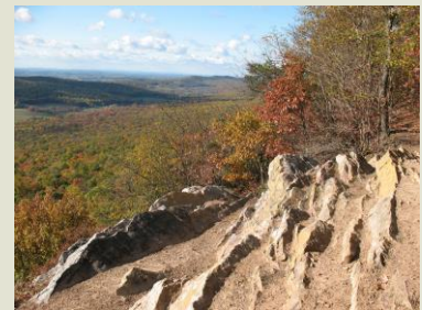
View from Blue Mountain