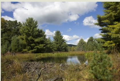
Cranberry Swamp Natural Area