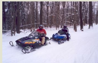
Riders enjoying snowmobile trail