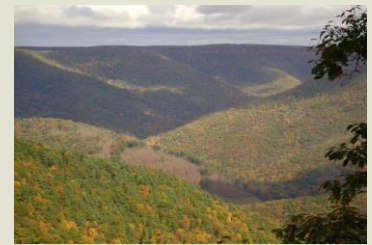
Hyner Run vista