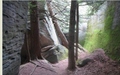
Chuck Kiper Trail