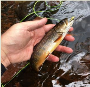
Native brook trout