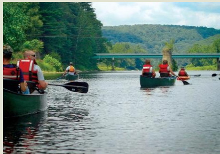
Canoeing the Clarion River