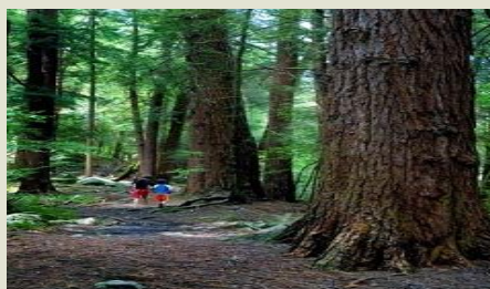
Old-growth hemlock trees