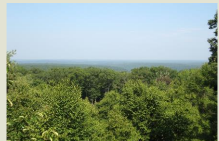
Bear Town Rock Trail vista