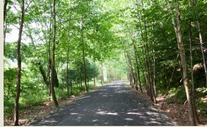
Pine Creek Rail Trail