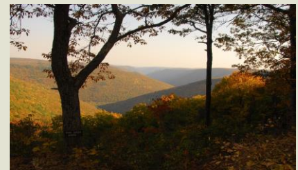
Vista on route 44