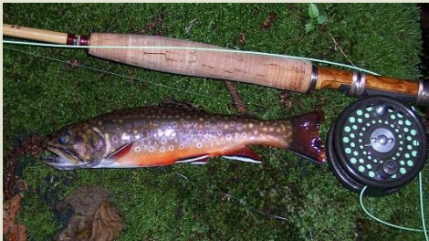
Native brook trout