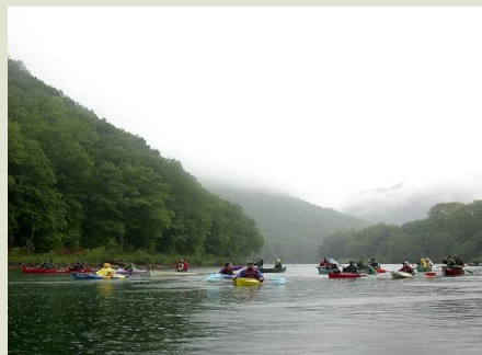
Paddlers floating Pine Creek