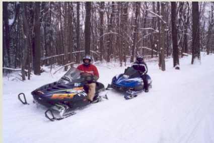
Riders enjoying snowmobile trail