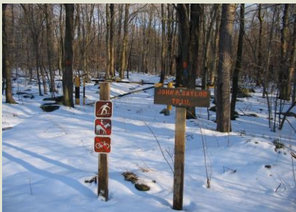
John P. Saylor Trail