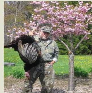
Turkey hunting success