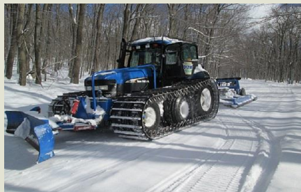
Snowmobile trail grooming machine