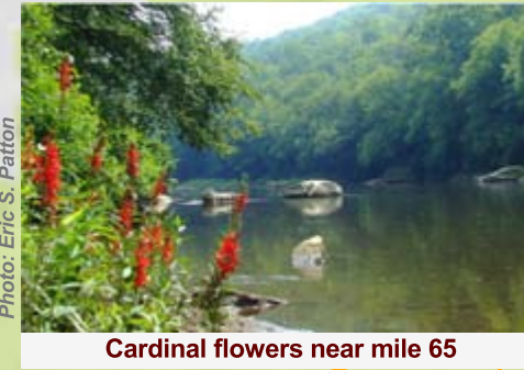
Cardinal flowers near mile 65