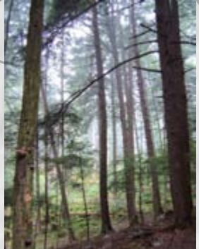
Old growth forest at Cook Forest State Park near mile 51-river right