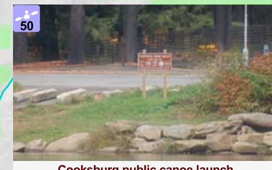
Cocksburg public canoe launch