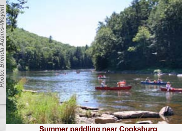
Summer paddling near Cocksburg

Caution Information There are four class I to I+ rapids on this section (miles 77.1, 70.0, 69.3 and 42.5) that can be navigated by scouting ahead. Several other riffles are identified on the map that can be navigated with minimal paddling experience. Avoid the upstream side of bridge abutments. Motorboat traffic can be heavy from miles 39.5 through 27 on Piney Lake.