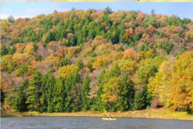
Fall colors near mile 45