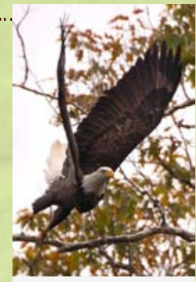
Bald eagles nest in several places along the Clarion River